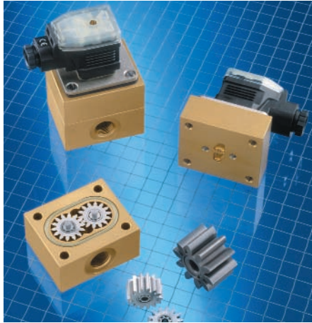
Flow Measurement Equipment