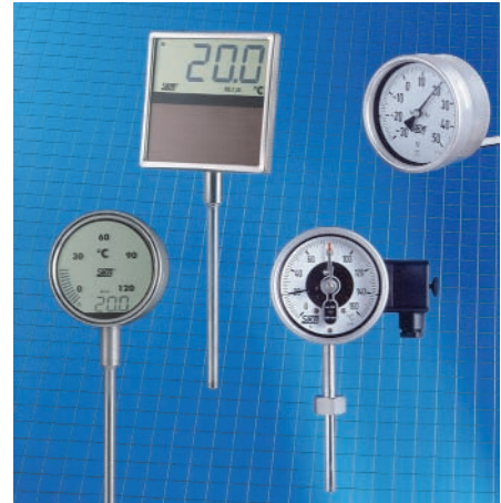
Electronic Digital Thermometer, Dial Thermometer