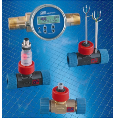
Axial Turbine Flow Sensor