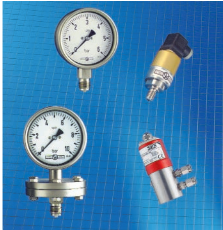
Pressure Gauges and Pressure Sensors